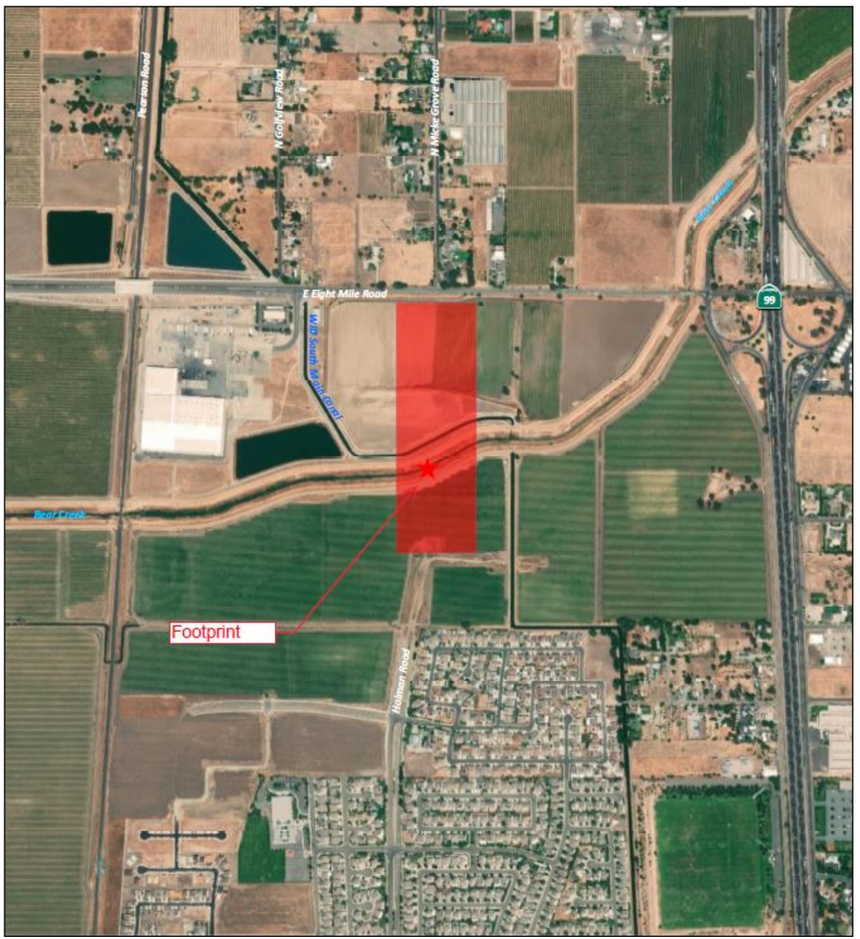
3) Proposed Footprint map