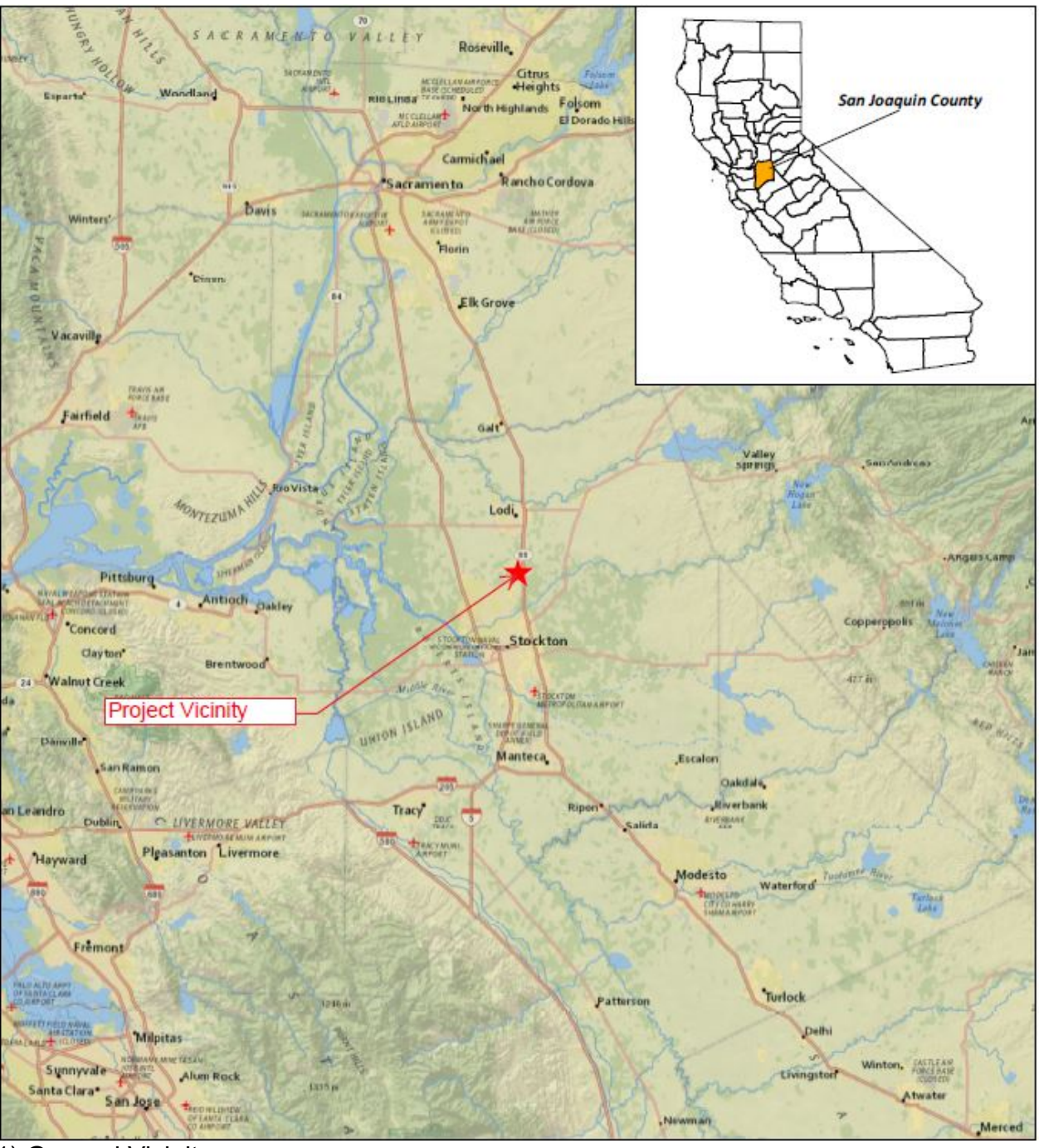
1) General Vicinity map